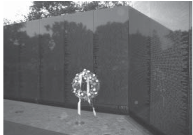
TLCB wreath at Vietnam Veteran's Memorial, July 2005

When the last pristine, soulful note of Taps had died away, I found myself attempting to swallow the lump in my throat. I was proud to be part of the great Brotherhood of Service shared by all veterans, regardless who, or where, or when they served, and I felt a new swelling of pride in this great organization of which I am a part, the Thailand, Laos, Cambodia Brotherhood.