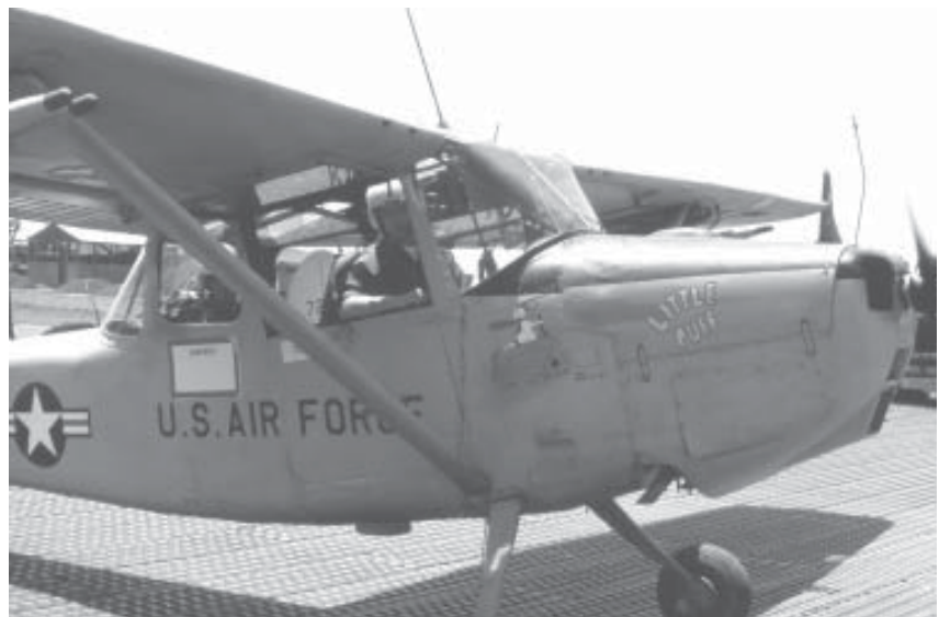
Cessna O-1F Bird Dog on PSP in Vietnam. NKP aircraft were similar, without interesting decorations. Flares were hung on rocket stations, shown here with 2.75 inch rockets with white phosphorus smoke marking warheads. Starlight scope was used by the rear seat crewman during the December, 1966, test.